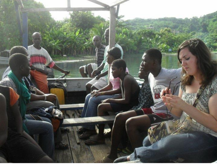
Boat ride on Bosumtwi Asteroid Lake, near Kumasi