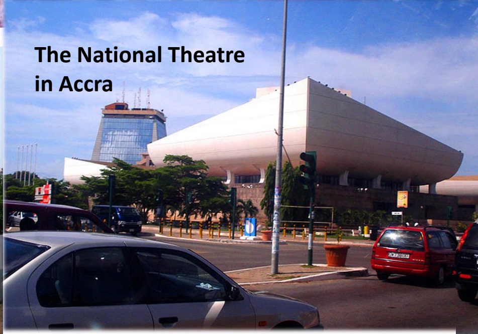
The National Theatre in Accra