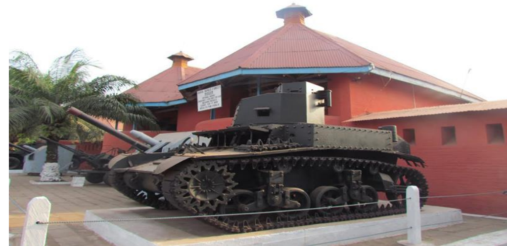
Military Fort and Historical Museum, Kumasi