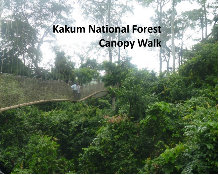
Kakum National Forest Canopy Walk