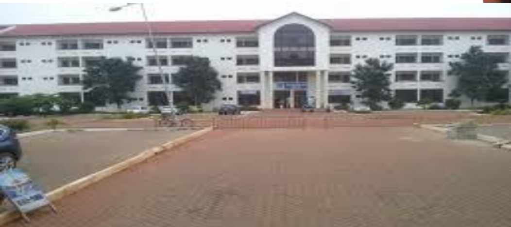
International Students' Hostels (popularly called "ISH")