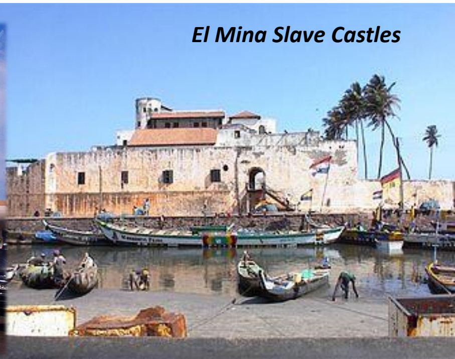
El Mina Slave Castles