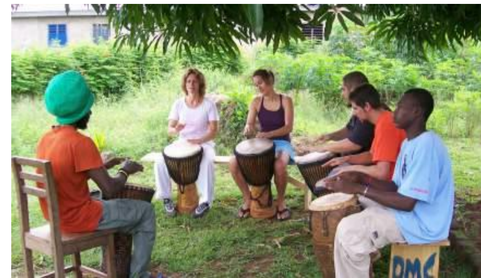
Drumming lesson UG Dance and Performing Arts Center