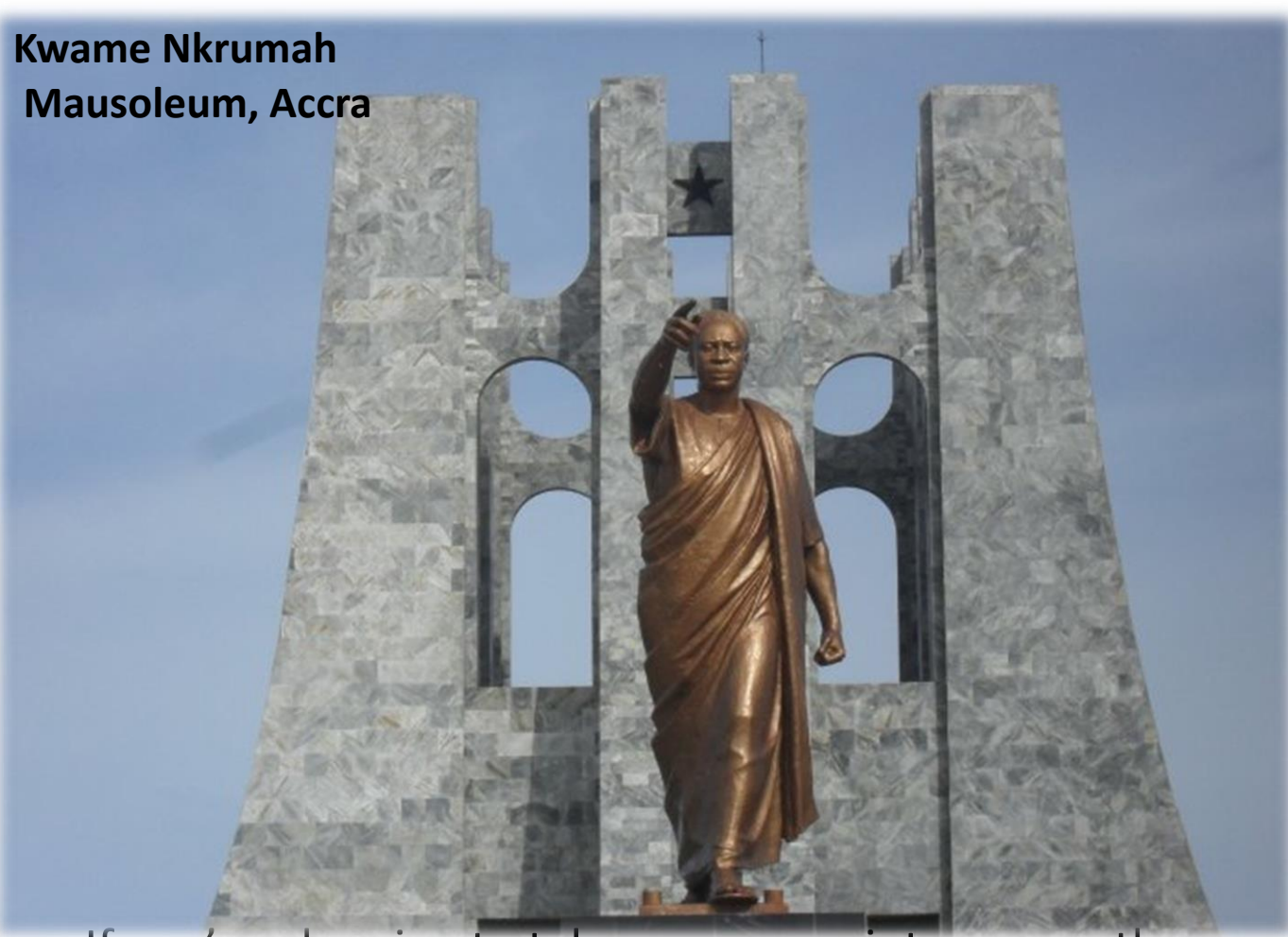
Kwame Nkrumah Mausoleum, Accra