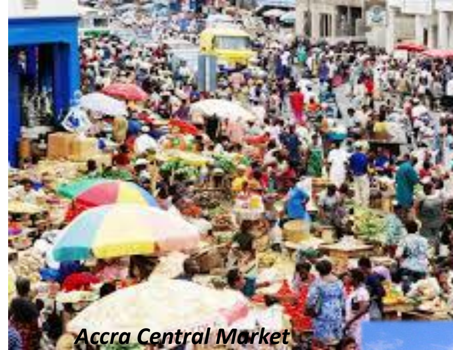
Accra Central Market